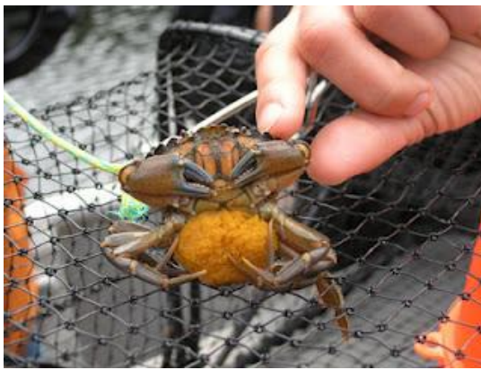
Berried Female Crab