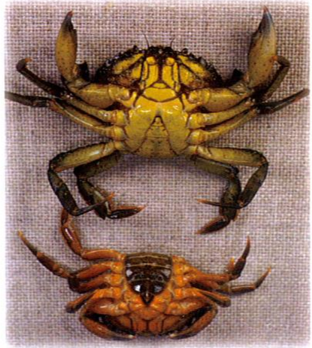
Male (top), female (bottom)

The shape of the abdomen or tail flat is a thin triangular apron for males, while the female's is larger and rounder.