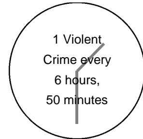
Number of Offenses — Comparative Data 1998–1999